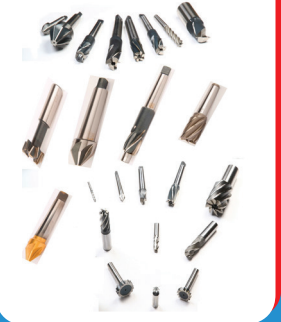
HSS END MILLS