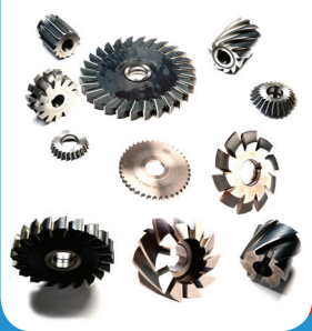
HSS MILLING CUTTERS