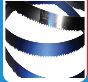
ADDISON junior® BI-METAL BAND SAW BLADES